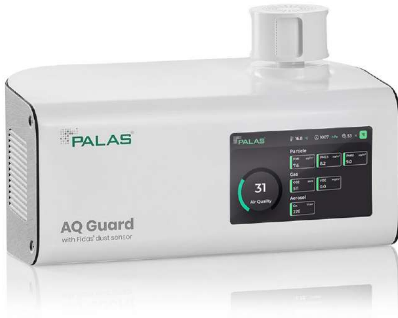
Fig. 1: AQ Guard

AQ Guard, currently the most advanced compact analyzer for determining indoor air quality, continuously and reliably analyses airborne fine dust particles in the range 175 nm – 20 \mu m. A newly developed mass conversion algorithm calculates PM values based on single particle optical light scattering, taking signal duration and shape into account. Sensor system and algorithms were developed based on the technology of the EN 16450 certified Fidas® 200. The "Ambient" version (with heated aerosol inlet) achieves precision comparable to type approved analyzers, which makes AQ Guard stand out compared to similar devices.