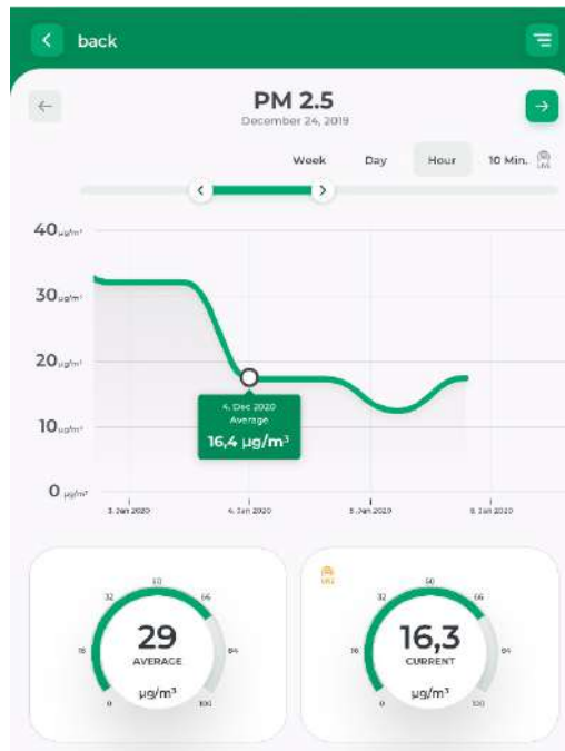
Fig. 4: Web interface

AQ Guard features fast data interfaces and allows real time access over Ethernet, WiFi or cellular network. Since all results are calculated and recorded within the analyzer it requires no external data processing by, e.g., cloud computing. Users retain full control over their data and decide over information access. AQ Guard can provide numerical data, using various communication protocols, as well as visualize information on any type of device using a modern web interface.