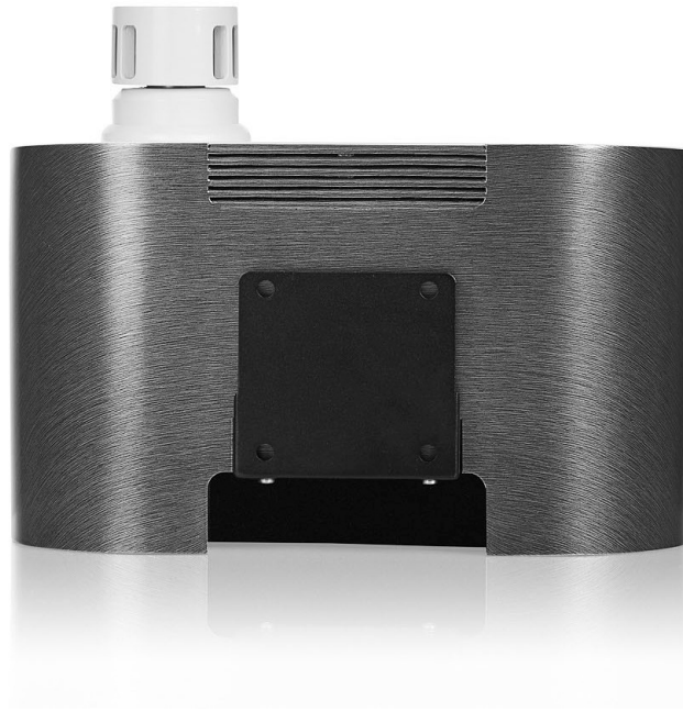
Abb. 3: AQ Guard Ambient mounting AQ Guard Ambient features a robust, attractive weather shield and can be combined with a multitude of mounting systems by a VESA compatible bracket. Special ruggedized versions for hazardous environments are available on demand. AQ Guard Ambient records air temperature, pressure and relative humidity with integrated sensors. Additional sensors for gaseous pollutants are in development.